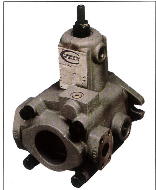
Variable Displacement Vane Pumps